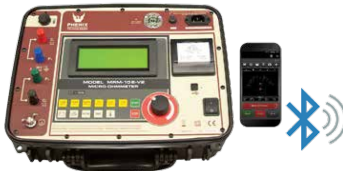
Model MRM-10E-V2 10 Amps with enhanced accuracy