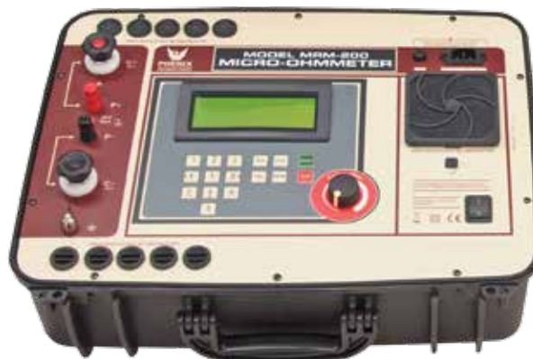
Model MRM-200 200 Amps