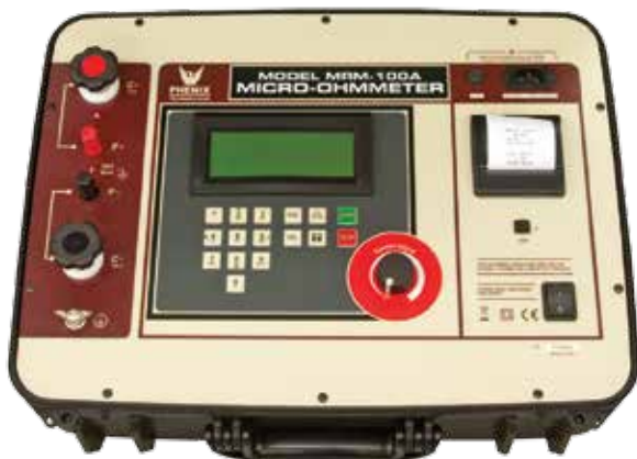
Model MRM-100A 100 Amps