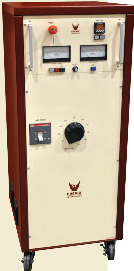
Model 615-7.5P (with dwell timer option)