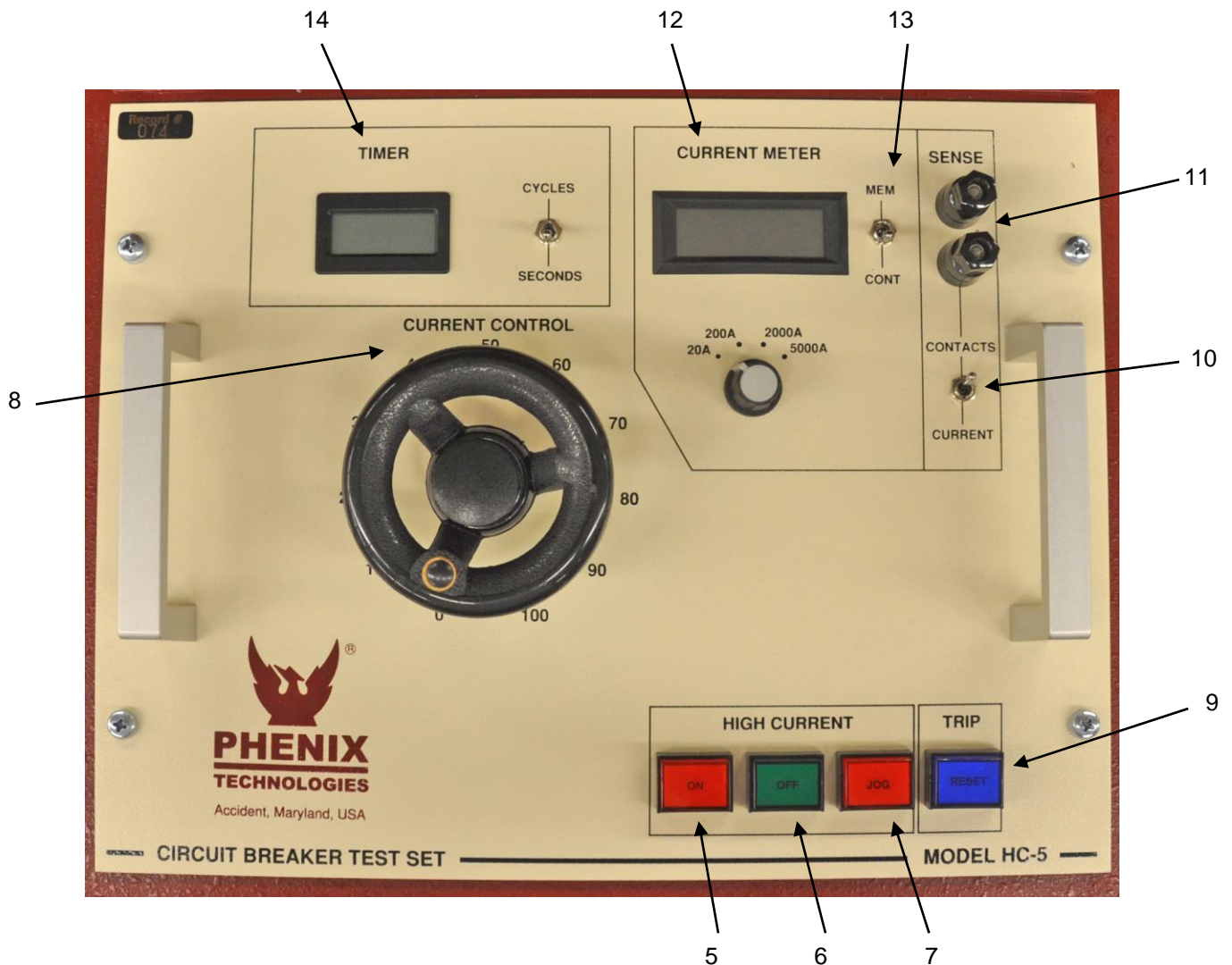
Figure 2. HC-5 Controls and Indicators