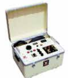
High Current Test Set 2000 Amp