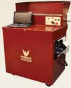
25 kVA Core Loss Tester