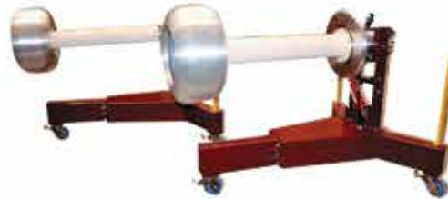
Water Cable Terminations