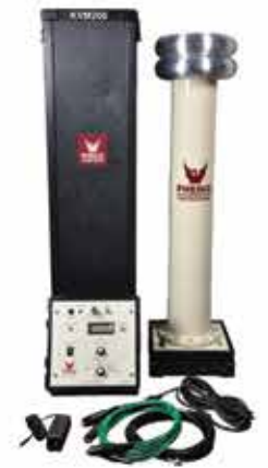
AC/DC Kilovoltmeter 200 kV