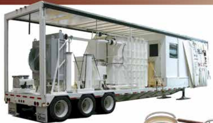
Variable Frequency, 265 kV, 22 MVA