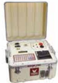
Microhmmeter 100 Amp