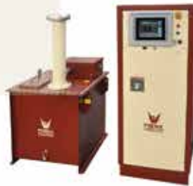
AC, Tank Type, 75 kV, 20 kVA