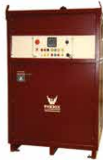
100 kVA, AC