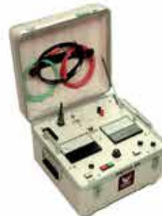
AC/DC Hipot/Megohmmeter 10/25 kV