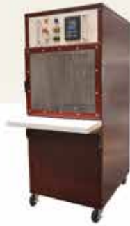
AC, 20 kV, ASTM D149