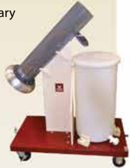
Oil Cable Terminations