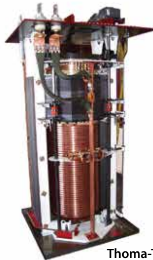
Thoma-Type 0-4160 V, Single Phase