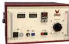
Benchtop AC Hipot 5 kV