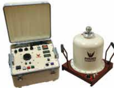
AC Hipot 30 kV