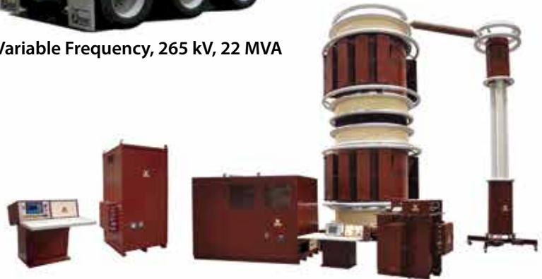
Cascade Type, 500 kV, 25 MVA