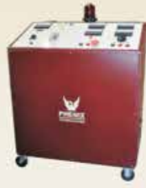
50 kVA, AC/DC