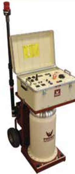
Aerial Lift Test Set Model BK 130/36