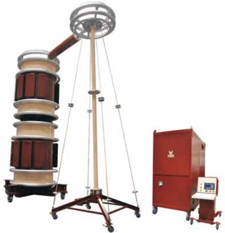
AC, Cascade Type, 400 kV, 800 kVA