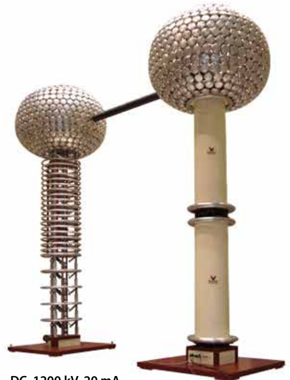
DC, 1200 kV, 20 mA