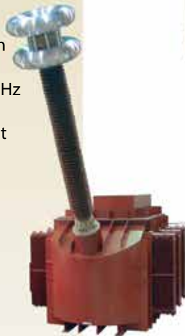
Series/Parallel, 400 kV, 2000 kVA