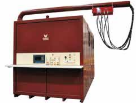
1500 kVA, AC/DC