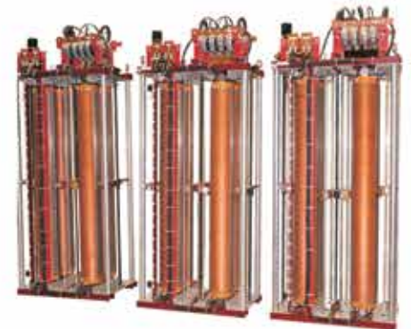
Column-Type 0-480 V, 3 Phase