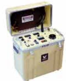
DC Hipot 75 kV