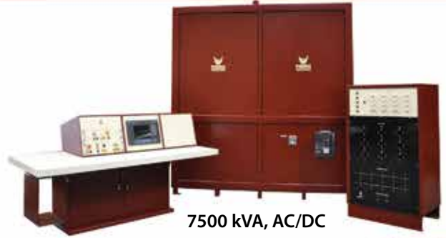
7500 kVA, AC/DC